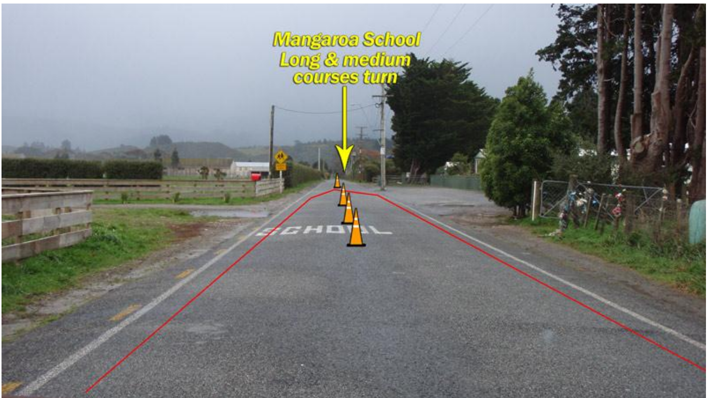
Approach to Mangaroa School (turn point for Medium & long Courses)

The Roads are open for all traffic - including you as a participant in the Scorch and all other possible normal road users. (including trucks, buses, cars, motorbikes and other recreational cyclists and runners)