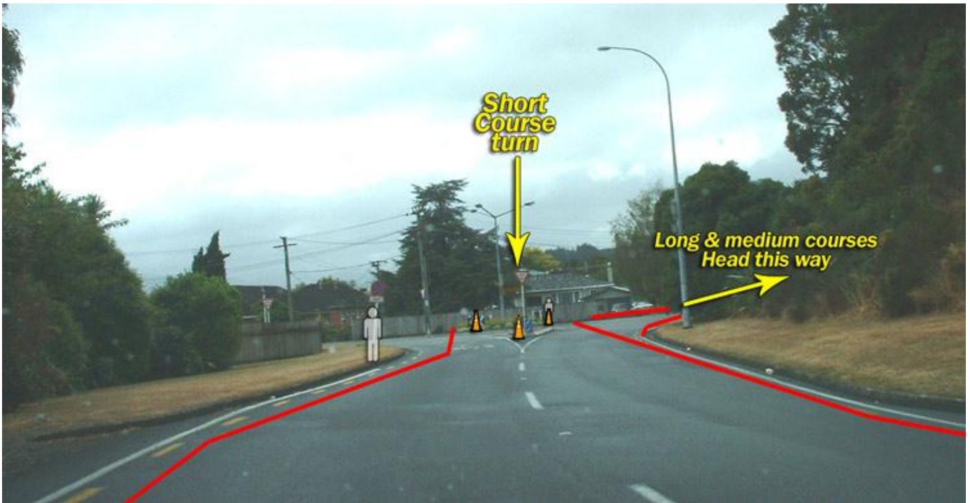
Approach to Ward Street Roundabout (turn point for Short Course)